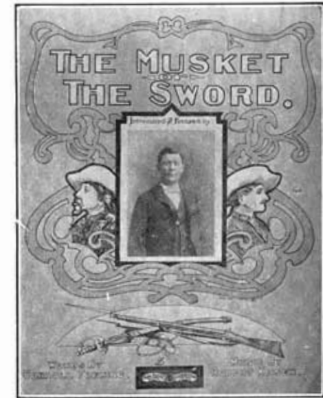
A Martial March Song of more merit than any other in its class. Original, inspiring. A ringing melody with the haunting quality of a lasting hit. Price, 50 Cents.

STOP AT SOME SHOP SELLING SHEET MUSIC AND SECURE SOME OF THESE SUPREME AND STERLING STANDARD SONG SUCCESSES OR SEND 25 CENTS IN STAMPS OR SILVER AND HAVE SAME SENT STRAIGHT FROM THE PUBLISHER