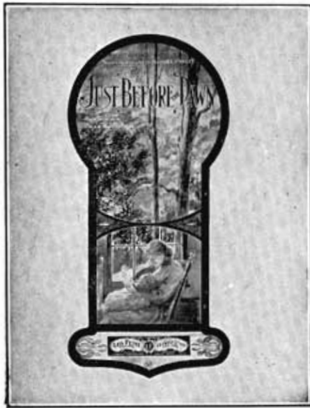
"Just Before the Dawn" has many admirers. It is a clever, original and pretty song, containing a heart-touching story admirably told, and has a chorus just such as you would make a pet favorite. Price, 50 Cents.

SPECIMEN SKETCHES OF SUPERIOR SENTIMENTAL SONG SUCCESES OF SURPASSING MERIT. SOME SWEET AND SOFT. SOME SAD AND SERIOUS. SOME STRIKING AND STARTLING, BUT ALL OF THE SATISFACTORY SORT STRONGLY SOUGHT